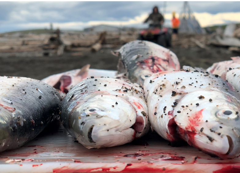
Qaaktaq Shingle Pointmi.