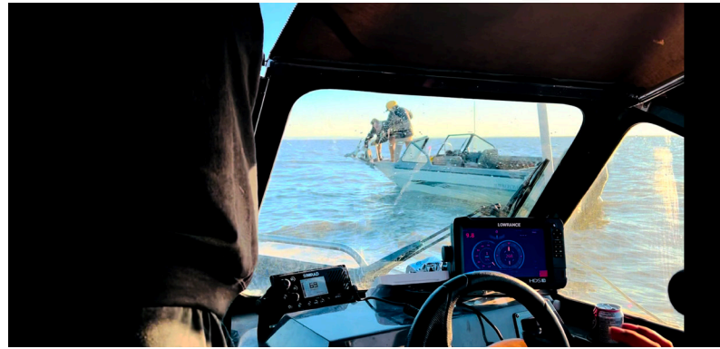
Aullayuaq taputiyaq nipaliq takunnagaa apurvik Shallow Baymi (Niaqunnaq).