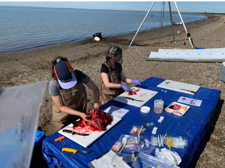
A.Dalpe asulu E. Couture takunaqtuq niryun maqaiqtuag ilisaqtuat amiq takunaqtuq qilalugaaqun ARHI-DL-24-II.

qilalugaq atautchikun DFO qiniraa savaktiit asulu FJMC qilalugaq takunnagaa savaktuat Tuktoyaktuk HTC ikayuqti kiilu takunaqtuq takunaqtuq Kivanmun Beaufort Sea qilalugaq surraituqmun. Taamna sivulliq ukiuq savagaa qinigaalu qilalugaq isuma tutqaaqtuq tadjvinaq tarium niryutait kiuyuat inuuniarvik apiqsiyuat tapqua allauyuag inuum katitait qilalugaq. Kiilu 1500 takunaqtuq tutqaaqtuq tapqua ilurriyaalu qinigaa una ukiuq. Qilalugaq Aimayuut sivunniurutit taimannga atugaa Sallirmiut savaat takunnagaa sila nunamilu allauyuat isuma qilalugaq katitait asulu inuuniarvik nunami.