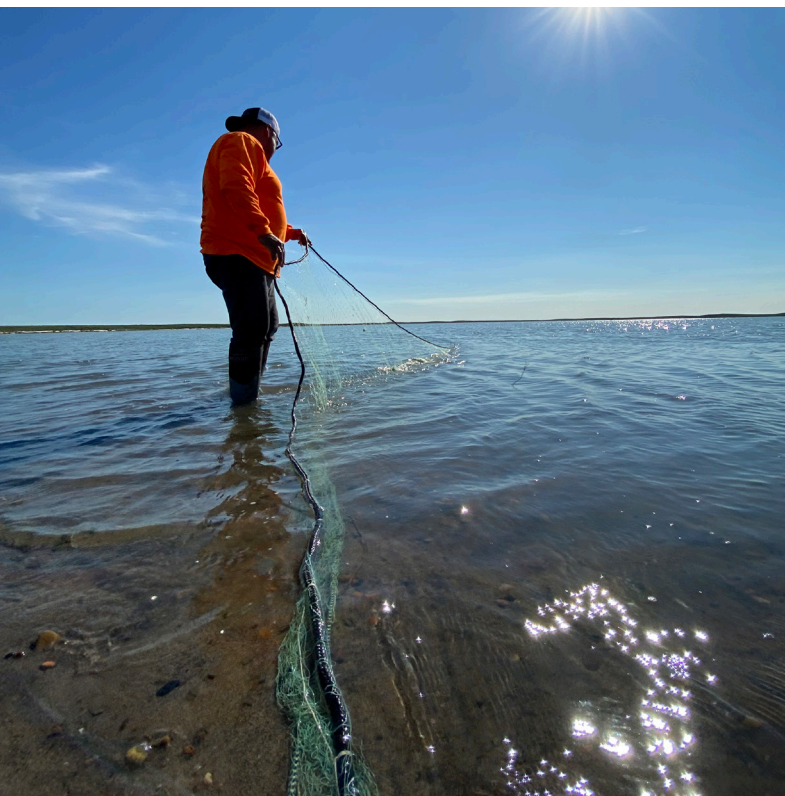
Kubyaqtuuq nuuniarvik takunnagaa.