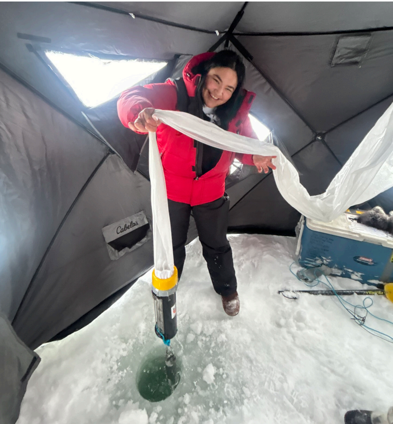
Ukiuq inuuniarvik takunnagaa.