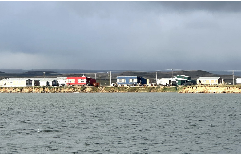
Inuuniarvik Paulatukmi.