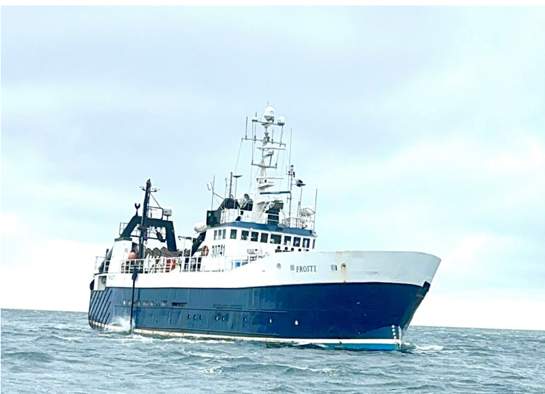
DFO umiaq FV Frosti.

Taamna AN MPA Savak Katitait savaaktuat tadjangatchiaqtuaq ilisaqtuaq Arctic Savaktiit PAME isaktuaq, tutqaayuq allauyuaq Nunaruaqqaqtuat isuma ilitaq. Taamna tadjangatchiaqtuaq ilisaqtuaq nakuuyuq iluaqtuaq Nunaruaqqaqtuat ilisimayuaq ilitaq aasiin ikayuqtuaq nunalika.