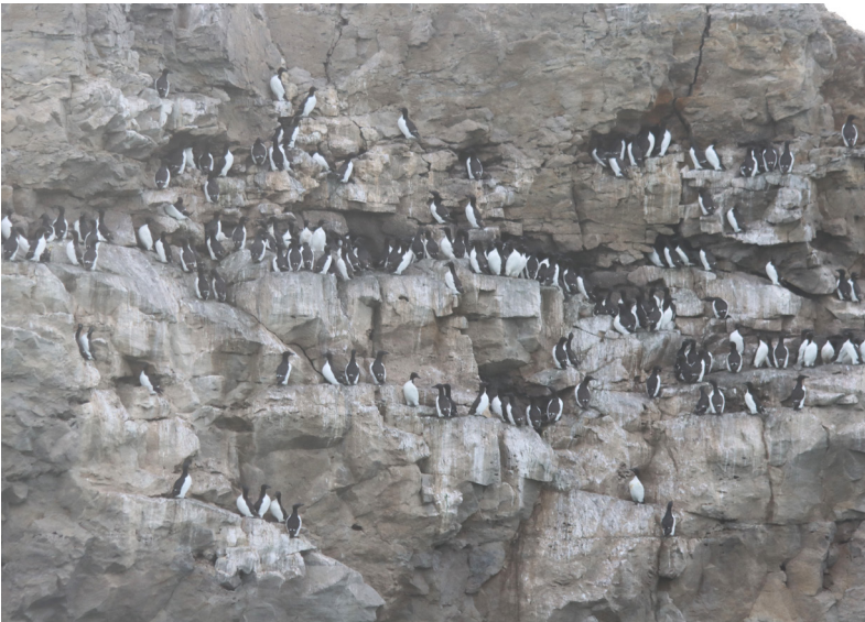
Inugiaktut nakkaqtuaq tingmiaryuk katitait imnaq Cape Parry Aulayuut Tingmiaryuk Uqqituaq Nuna, taamna Anguniaqvia Niqiqyuam tariuq uqqituaq nunami.

Iluuqtuaq makpiraat 2024mi qiuyuat taamna MPA ilitaq pisuktuaq ilisimayaa kangiqsiyaa niryunat isaktuaq asulu tuyugaa isaktuaq, ila: