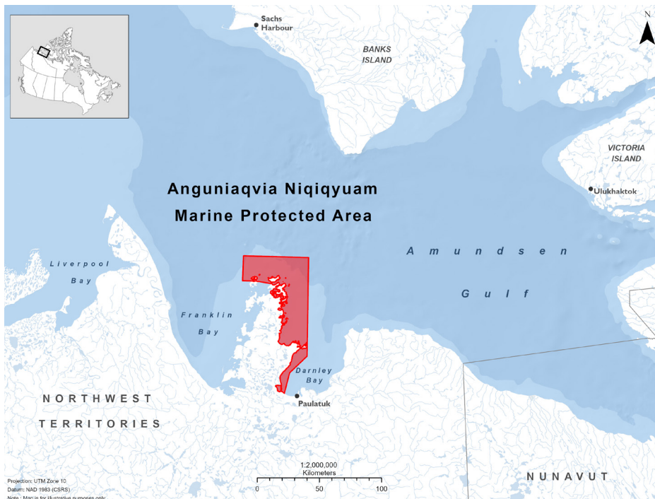
Nunauyaq Anguniaqvia Niqiqyuam tariuq uqqtuaq nunami (MPA).