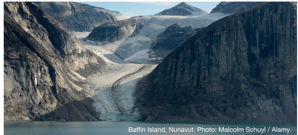
Baffin Island, Nunavut.

Piqaluyakmit auktuqnia tariumukpaliayuq ataanit qulaata piqaqnit niqauvaktut turaqhugu turaqmagulu piplugit.