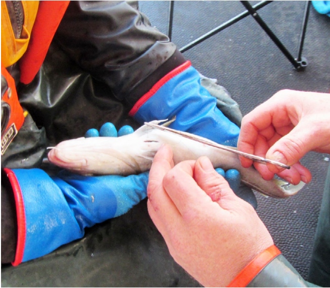
Nuji-wasqotesteket: B. Zisserson