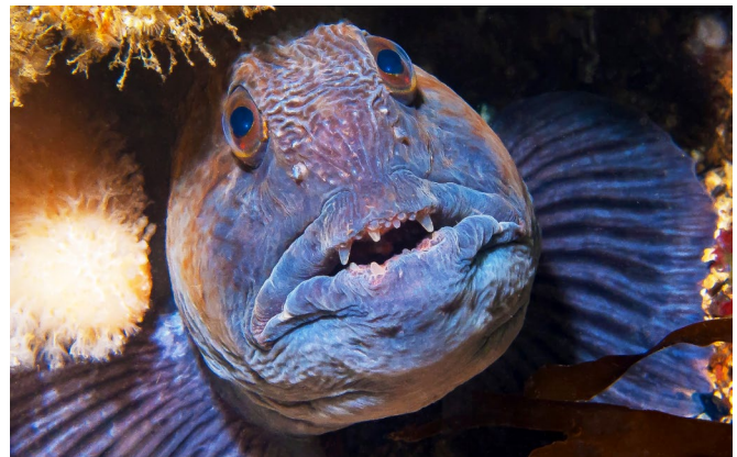
Nuji-wasoqotesteket: DFO Newfoundland

DFO aqq L'nu'k tleyultjik No'pa Sko'sia siawi toqi-lukwutijik kisa'tunew maw-lukwutimk wjit elmi'knik tel-nikana'lsimk aqq teli-nujo'tmi'tij MPA maw-lukwutijik.