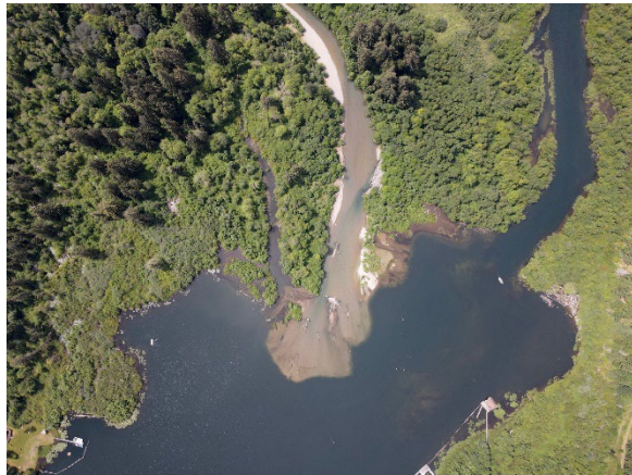
Figure 3. Downstream transport of sediment, impacting alluvial fan at Robertson River in 2022.

The aggradation of alluvial fans, stream flow and lake water levels are some of the site specific variables that can contribute to or limit the Vancouver Lamprey accessing and utilizing this habitat type during critical life stages (Figure 2). In Cowichan Lake, aggradation and low lake levels have resulted in alluvial fan habitat becoming dewatered prior to peak spawning periods within the spawning window. Removal of excess sediment could contribute to maintaining spawning habitat for Vancouver Lamprey, even with lower lake water levels. Therefore, for alluvial fans which have excess sediment that are at risk of being dewatered with low lake water levels during the spawning period, removal of excess sediment could be evaluated to determine the conservation benefits for Vancouver Lamprey. Creation of sediment traps could also be highly beneficial and provide some level of protection and stability to spawning habitat from continual aggradation.