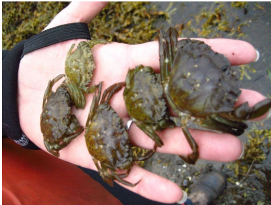
European Green Crab ( Carcinus maenas ); Photo credit: DFO.