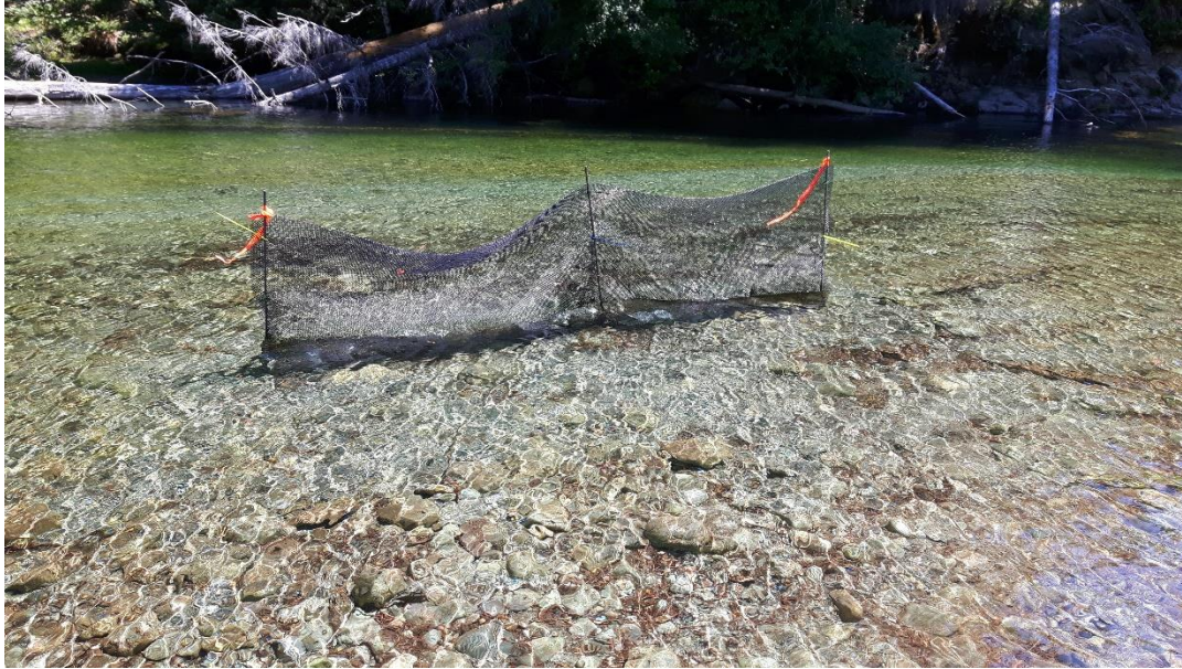
Figure 2. Example of a lamprey trap line. Photograph shows Vexar® weir held in place with rebar and six minnow traps at the base.