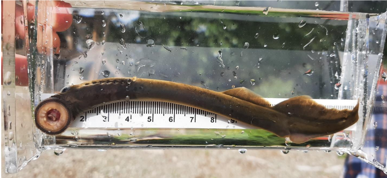
Figure 4. Female Cowichan Lake Lamprey in spawning condition caught June 2021 in a trap on the alluvial fan at the outlet of Halfway Creek, Mesachie Lake.