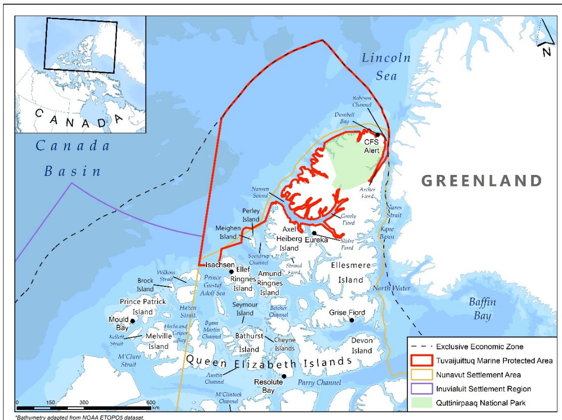
Figure 1. Current boundaries of the Tuvaijuittuq Marine Protected Area (MPA) in northern Nunavut. Adapted from DFO (2019).

The Tuvaijuittuq Marine Protected Area (MPA; Figure 1) was established by Ministerial Order on August 21, 2019 based on its importance to ice-associated species and in response to increasing accessibility for human activities in the Arctic. Protection via Ministerial Order under the Oceans Act allows the Minister of Fisheries, Oceans and the Canadian Coast Guard ("the Minister") to freeze the footprint of human activities in the area for a period of up to five years while a feasibility assessment is undertaken to determine appropriate the long-term protection tools for the area (e.g., designation as an Oceans Act Marine Protected Area [MPA] by Governor-in-Council and a National Marine Conservation Area under the Canada National Marine Conservation Areas Act).