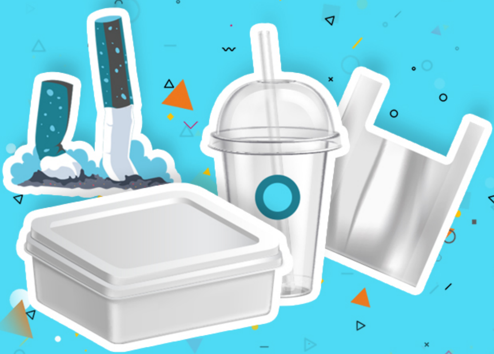
Single Use Plastics