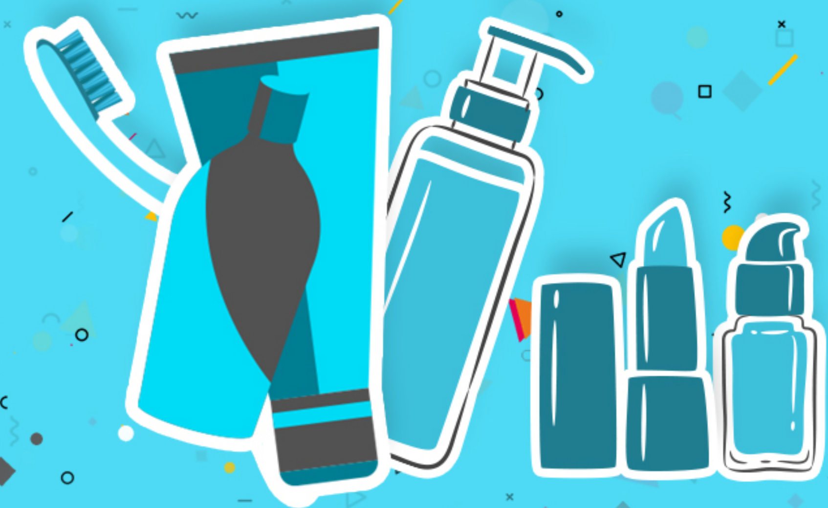
Personal Care Products