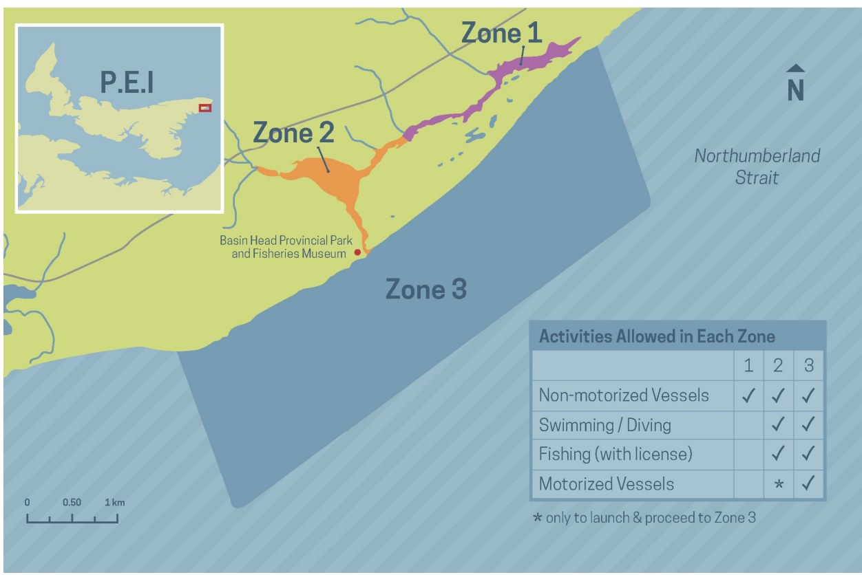
Figure 1: Basin Head Marine Protected Area and its three management zones.

The MPA encompasses Basin Head Lagoon and an adjacent offshore buffer zone in eastern Prince Edward Island within the Northumberland Strait (Figure 1). The MPA was designated by regulations to conserve and protect a distinct form of an otherwise common marine alga, Irish moss ( Chondrus crispus ). This form of Chondrus , also known as the giant moss, is thought to exist only within the confines of Basin Head. It reproduces only by fragmentation, does not reproduce sexually or by producing spores (Tummon Flynn et al. 2018), and has no holdfast but is held in place by byssal threads of Blue mussels ( Mytilus edulis ). Sheltered habitats often influence morphology of algae; this has resulted in relatively expanded blades for the giant Irish moss in Basin Head. However, spriggy outer coastal plants (i.e. narrow blades) sharing the habitat are attached to hard objects by holdfasts and have not developed into the giant form. The exploration of genetic differences between this and the other Irish moss population is a logical next step to try to understand the uniqueness of this strain. The use of microsatellite genomes to compare Irish moss strains may provide further insight on the differences among populations (see studies by Krueger-Hadfield et al. 2011, 2013, 2015). What is especially interesting and requiring management and protection is the giant Irish moss dependence on mussels for attachment.