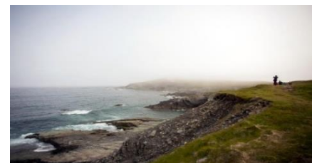
Rising sea levels can damage shorelines and coastal infrastructure

Port authorities and private insurance companies have sought out ACCASP information to develop emergency plans, conduct environmental assessments, and implement insurance policies based on flood risk vulnerability.