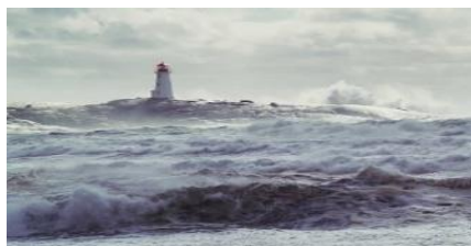
The most significant impact of future storms will likely be in areas of Canada where winter sea ice decreases.

The Geological Survey of Canada applies CIVI to inform their Coastal Climate Geoscience Program to help coastal communities plan for regional sea level rise.