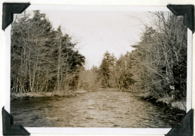
Main river above B-3