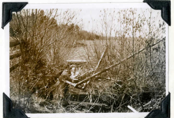
Remains of fishway on B-6