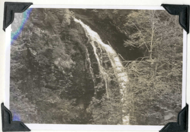
Waterfall on Big Brook