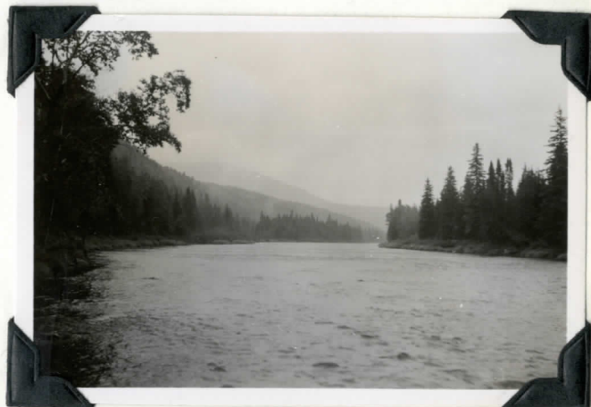
N.E. Margaree River