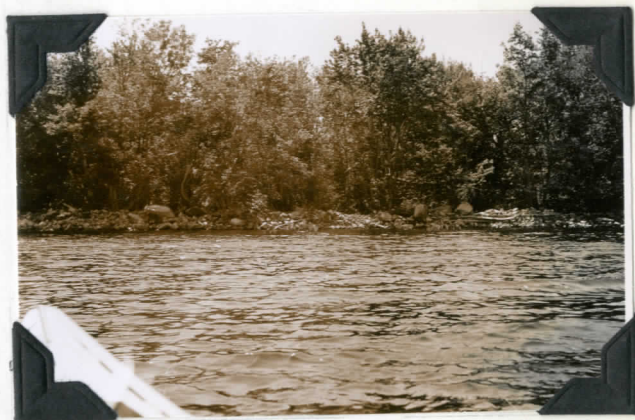
Rock storage dam at outlet of Pinetree Lake.