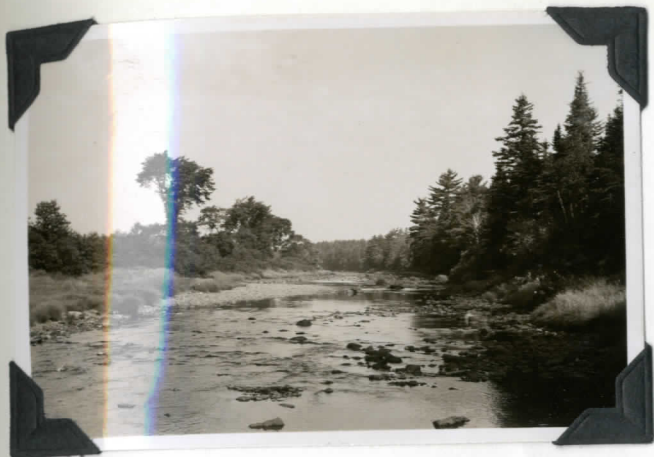
East River St. Mary