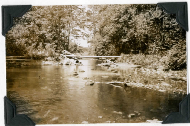
Remains of Jim Ried's storage dam on outlet of Three-island Lake.