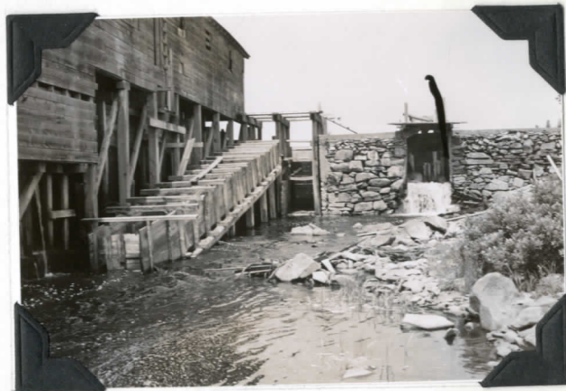
Harrington's dam showing water lost by leak in gate.