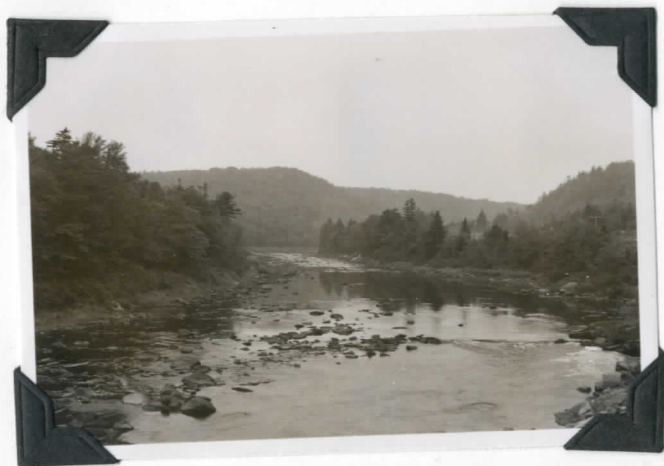
Main St. Marys River below Stillwater