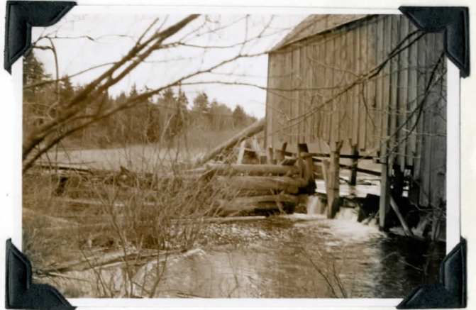
B-7 Dam on Blockhouse Mill Brook