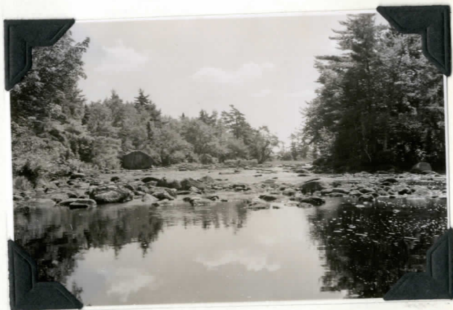
Near confluence with Davis River.