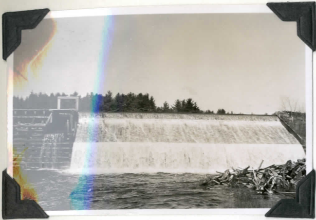
B-1 N.S. Power Commission Dam