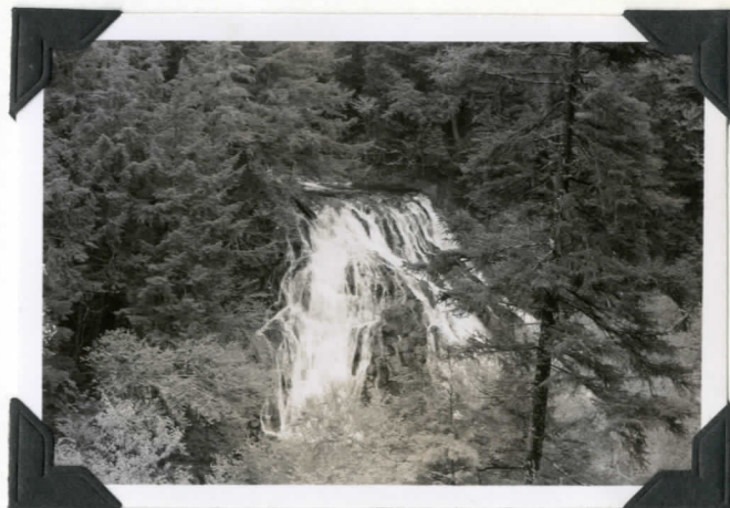
Waterfall on Black Brook