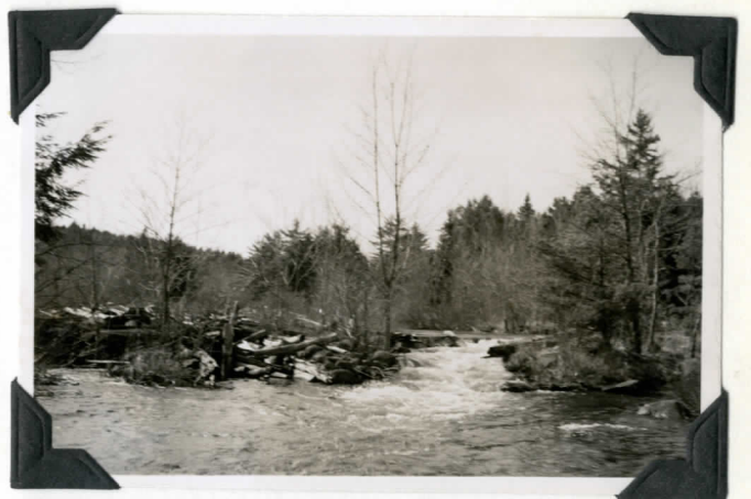
B-3 Remnants of old dam