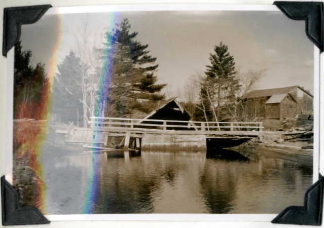
B-4 Dam and old sawmill in river