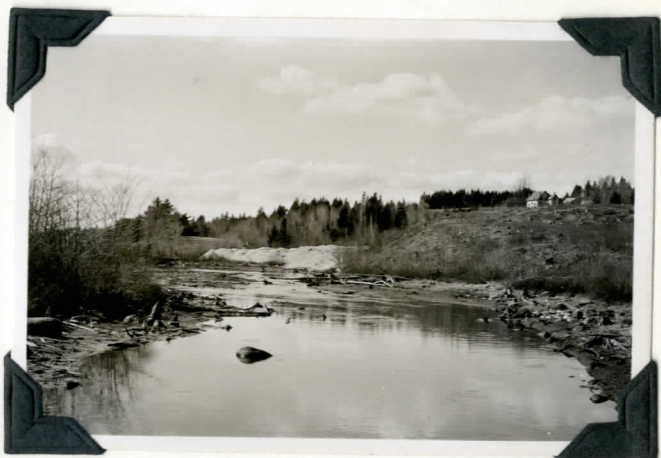
Sawdust pollution below B-5