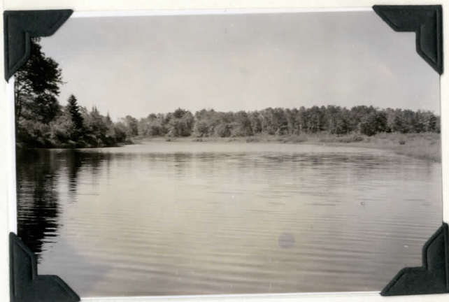
Stillwater area near confluence with Bloody Creek.