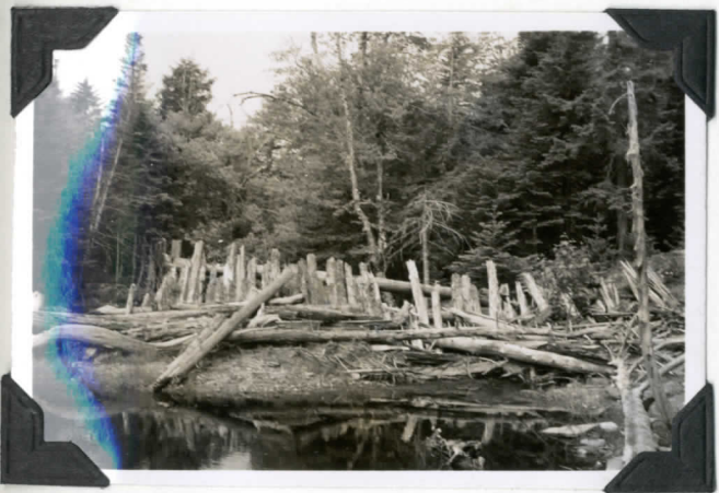
B-3 Dam on Glencross Brook