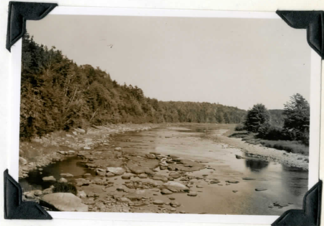
West River St. Mary at Upper Smithfield