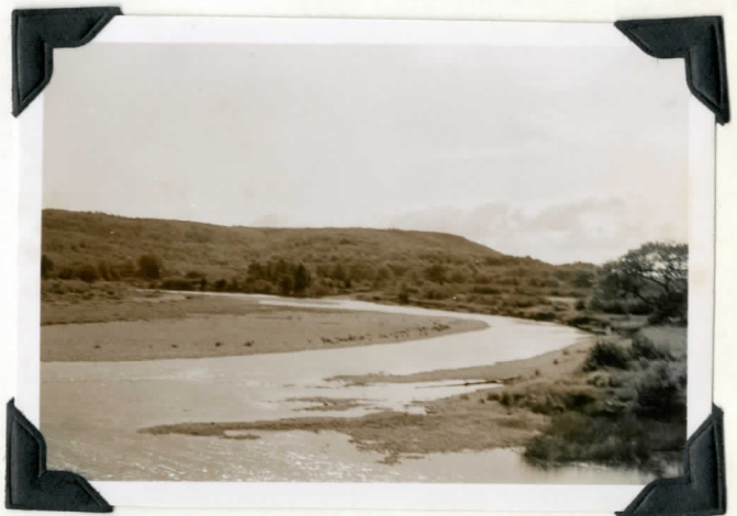
Confluence of East and West St. Mary River (Silver's Pool)