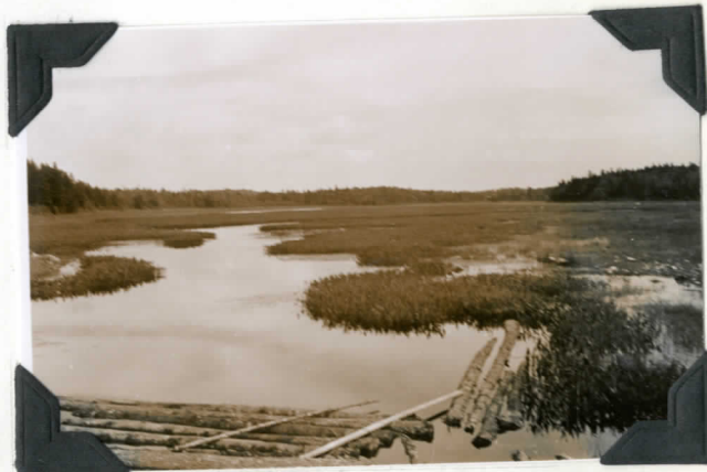
Proposed flowage site on Gaspereau Lake.