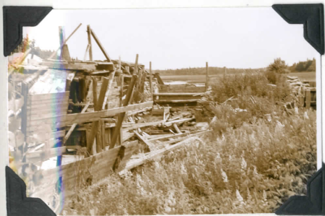
Remains of Felix's Mill on Gaspereau Lake.