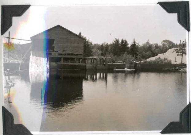
Harrington's dam showing exit from fish ladder.