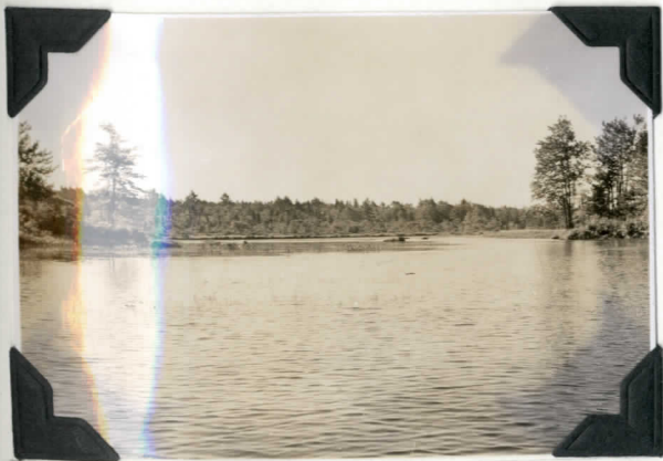
About one mile above Upper Clyde,