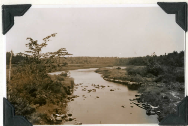
About one mile above Salmon River Lake.