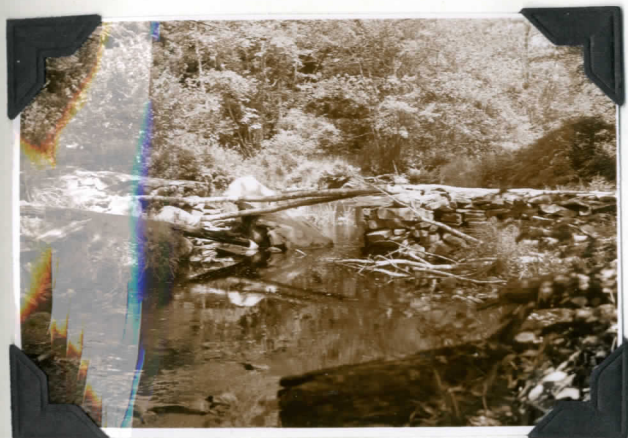
Remains of storage dam on outlet of Moosehorn Lake.