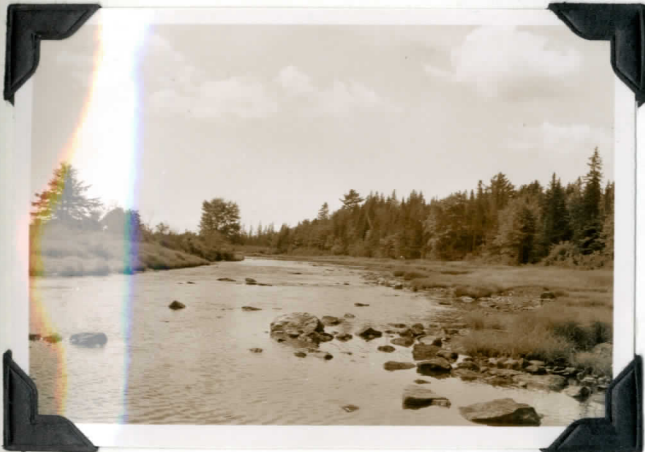
West River St. Mary at Cameron Settlement