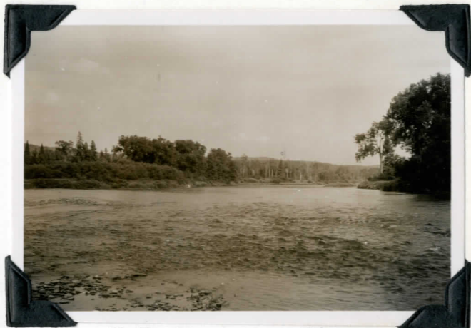
N.E. Margaree River at mouth of Nile Brook