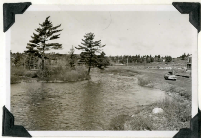
Main river below B-2