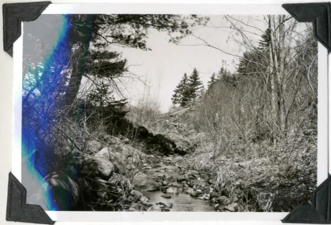
Run-a-round fishway at B-1