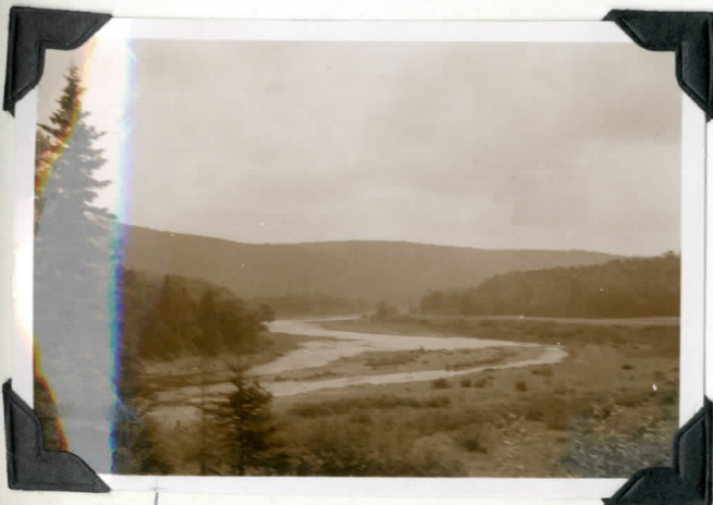
West River St. Mary at Smithfield