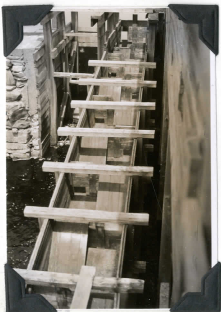
Fish ladder at Harrington's dam.