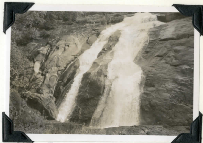
B-2 Falls on Second Forks Brook