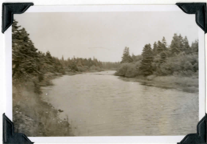
Southwest Margaree River