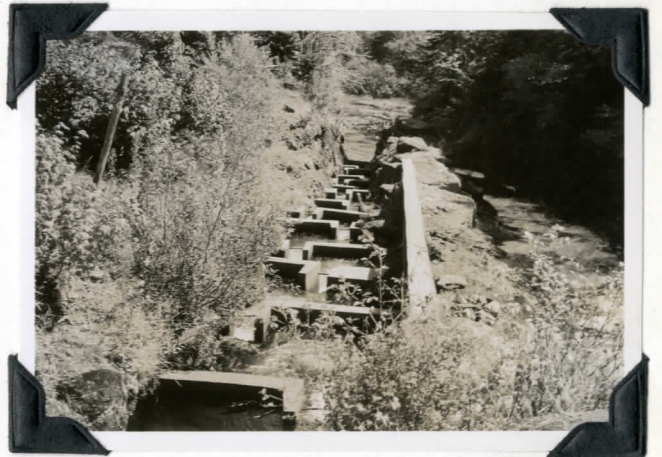
Fishway at Grand River Falls