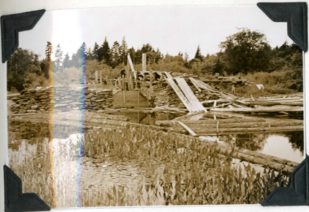
Remains of Filix's dam on Gaspereau Lake.