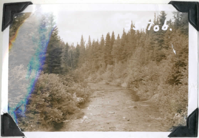
Waterfalls on Black Brook (West River)