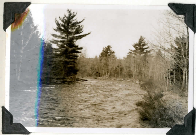
Main river above B-2