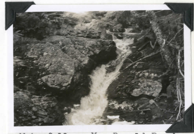
Waterfall on Mac Donald Brook