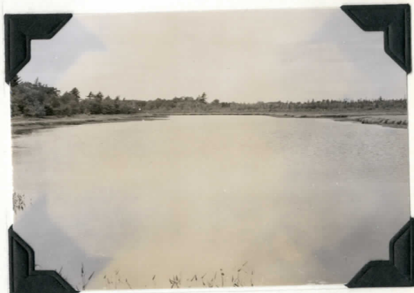
Stillwater area above old saw mill at Upper Clyde.