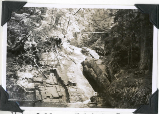
Waterfall on Chisholm Brook