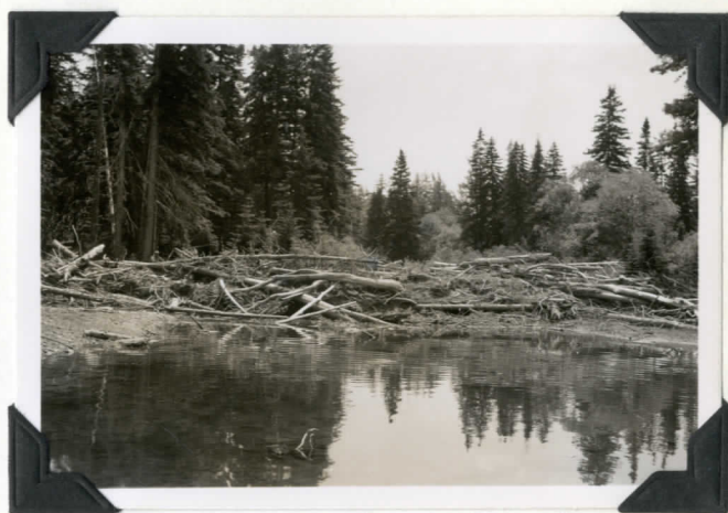
B-2 Dam on Cross Brook