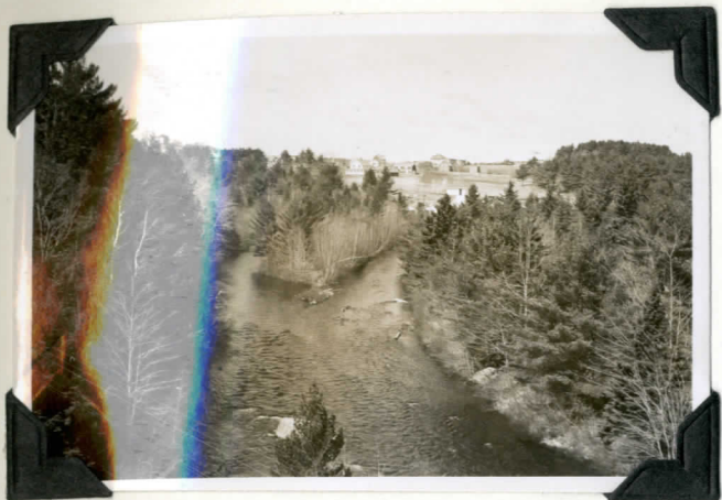
Main river below B-1