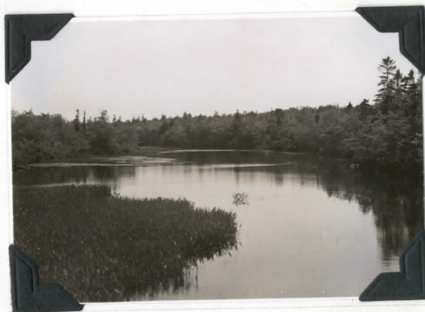
Stillwater about two miles below Salmon River Lake.