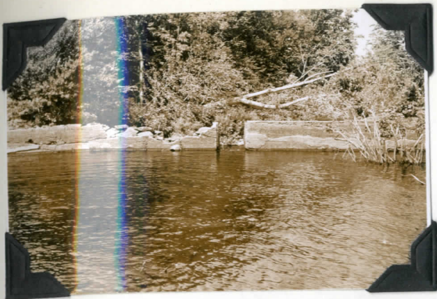
Storage dam on outlet of Salmon River Lake.