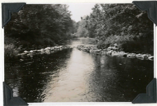
Showing one of many eel weirs found on the system.