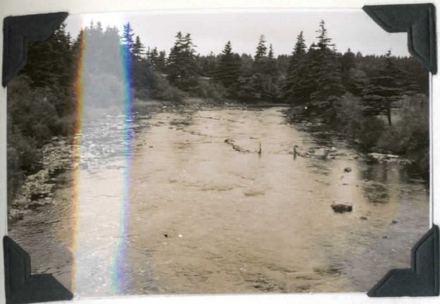
Shoal section at head of tide