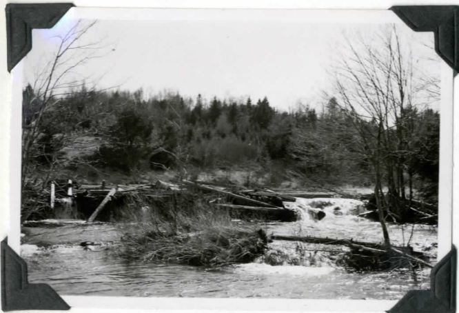
B-3 Remnants of old dam