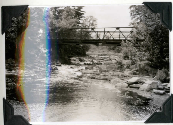
At Upper Clyde road bridge.