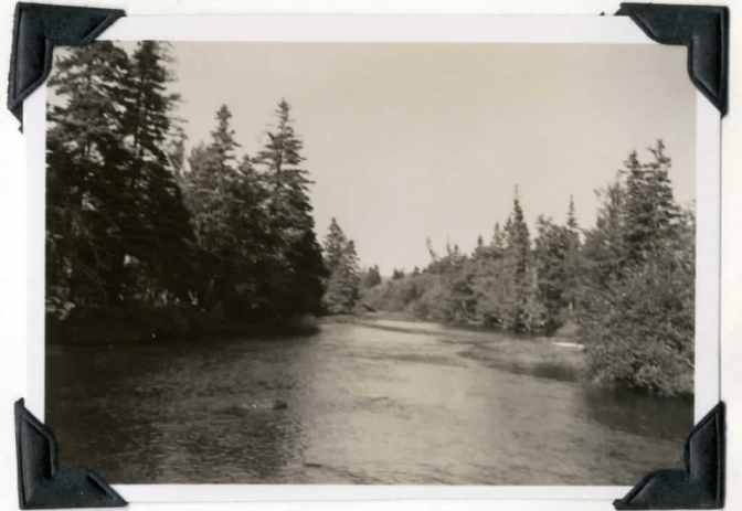
Lower section of Grand River