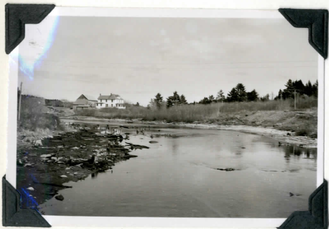
Sawdust pollution below B-5