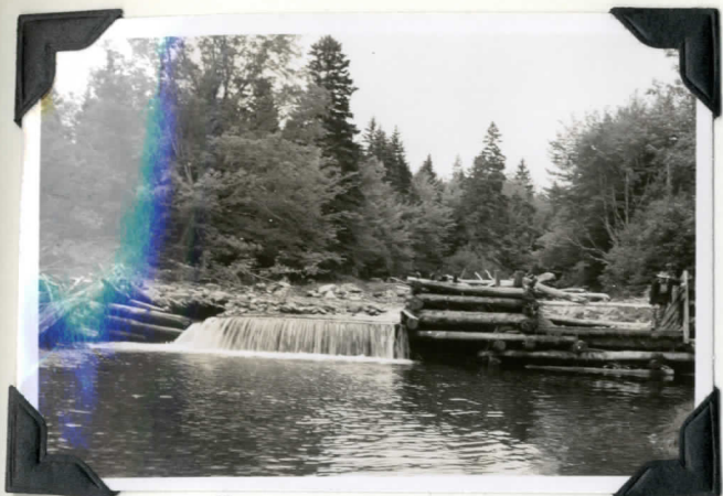
B-1 Dam on Big Brook