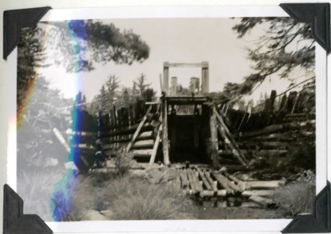
B-1 Dam on Upper Bryden Brook