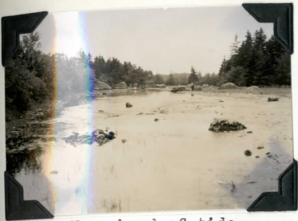
Near head of tide.