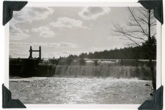
B-2 Harley Ernest Dam