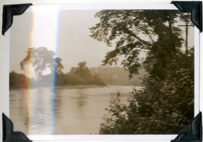
N.E. Margaree River below mouth of Big Brook