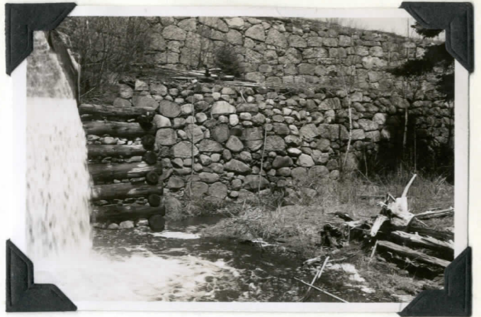
Entrance to fishway on B-1