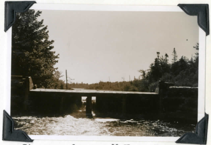
Storage dam on McKean Brook