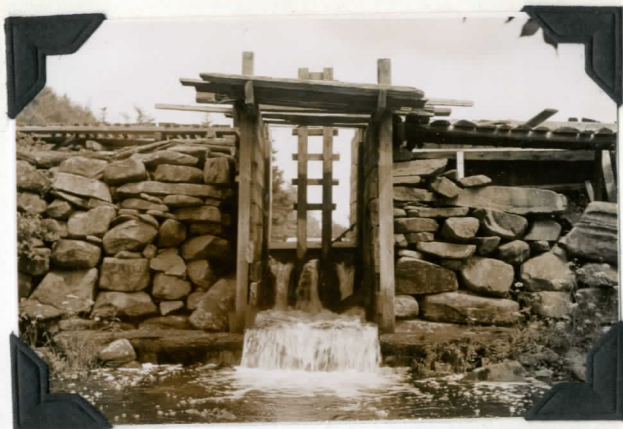
Jim Ried's dam at the inlet of Lower Corning Lake.