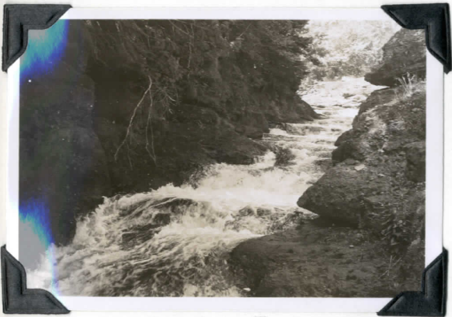
Grand River Falls