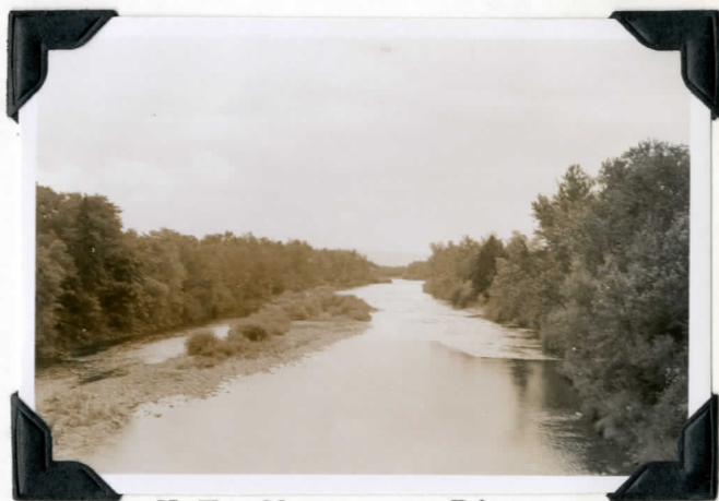
N.E. Margaree River below Ingram Bridge