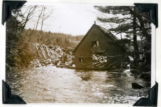
Old sawmill blocking the river