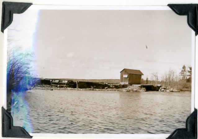
B-6 Dam on Little Mushamush Lake