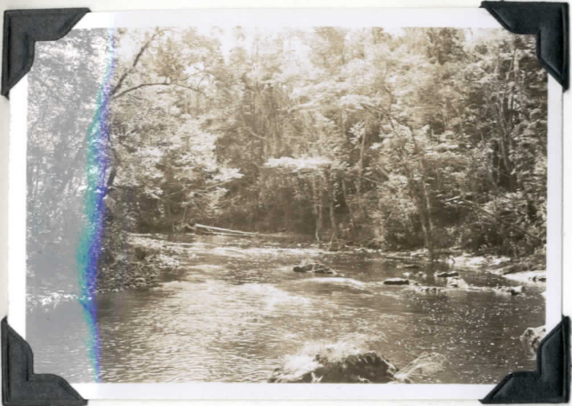
Upper section of Grand River