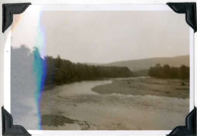
N.E. Margaree River below Cranton Bridge