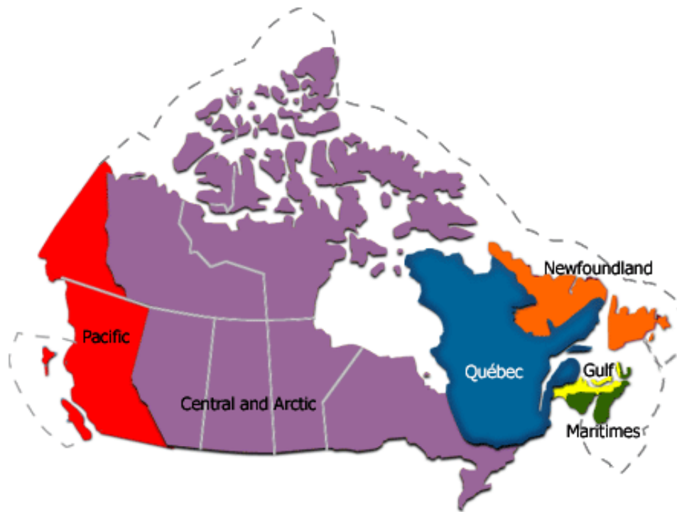
Figure 1. The six administrative regions of the Department of Fisheries and Oceans (DFO) in Canada.