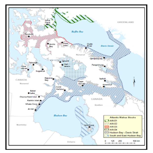
Figure 1. Location of Atlantic walrus stocks as identified by management units in the eastern Canadian Arctic. The stocks are Baffin Bay (AW-01), West Jones Sound (AW-02), Penny Strait-Lancaster Sound (AW-03), North and Central Foxe Basin stocks (AW-04), Hudson Bay-Davis Strait and South and East Hudson Bay stocks.