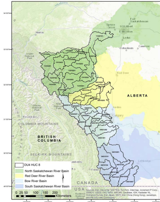
Figure 1. Distribution of Bull Trout in Designatable Unit 4, Saskatchewan–Nelson rivers populations.