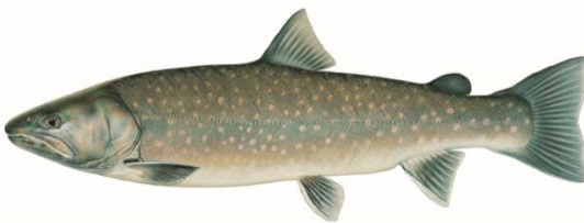
Bull Trout, Salvelinus confluentus © J.R. Tomelleri