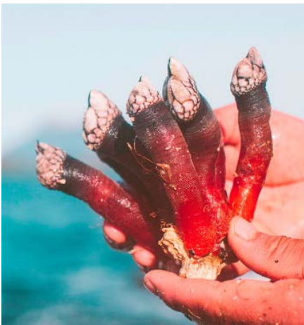
Goose Barnacles ( Ca?inwa , Pollicipes polymerus ).