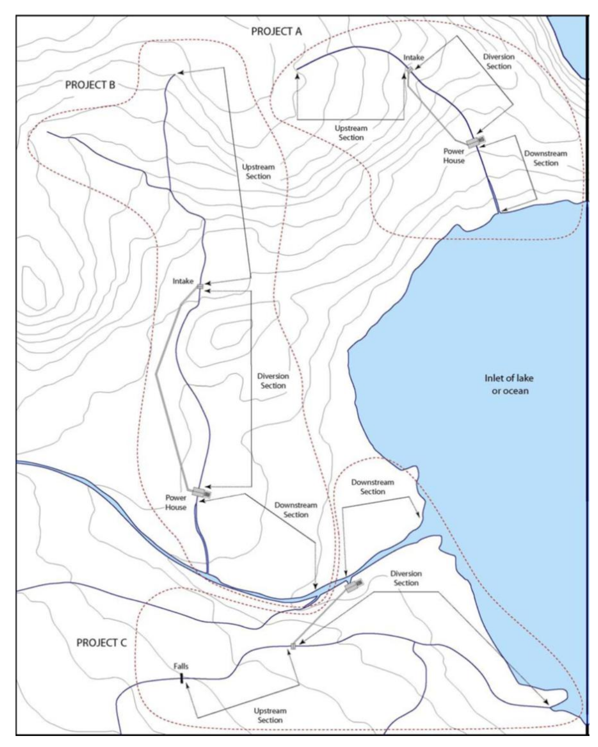
Figure 2.Examples of upstream, diversion, and downstream sections for three hypothetical hydroelectric projects (taken from Lewis et al. 2004).