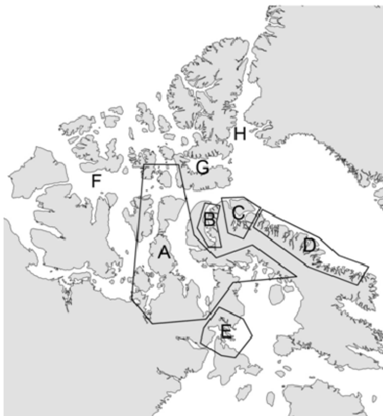
Figure 1. Approximate boundaries of Canadian summering aggregations of narwhals: A - Somerset Island, B - Admiralty Inlet, C - Eclipse Sound, D - East Baffin Island, E - Northern Hudson Bay. Other areas where narwhals are known to occur in summer: F - Parry Islands, G - Jones Sound, H - Smith Sound).