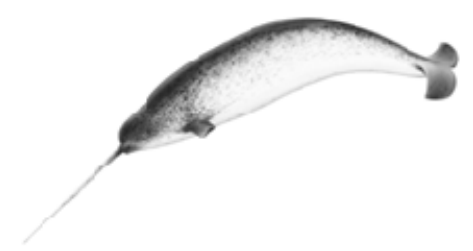
Narwhal ( Monodon monoceros)