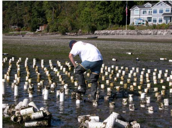
Figure 2: Commercial-scale, intertidal culture of geoduck clams ( Panopea generosa ) in Washington state, using PVC tubes for predator protection of young seed.