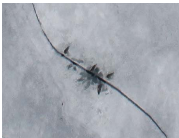
Ringed Seals hauled out along crack in sea ice in western Hudson Bay as observed from survey aircraft.