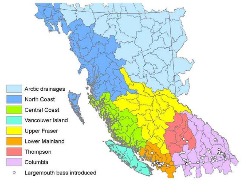
Figure 2. Distribution of known (confirmed) occurrences of Largemouth Bass in British Columbia. Note that one of the points in the Thompson Region is a misidentification. (from Tovey et al. 2008)

• Largemouth Bass is present in five regions in southern British Columbia and may spread by natural dispersal from these areas (Figure 2).