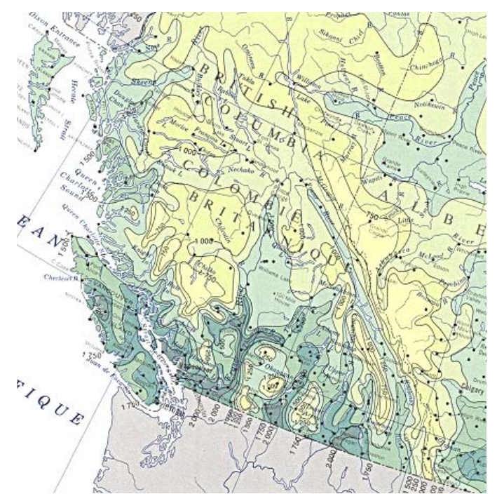
Figure 3. The Atlas of Canada Growing Degree Days map. The regions with >1750 DD (