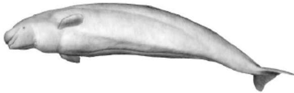
Beluga