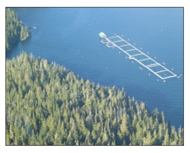
Net-pen along the coast of British Columbia.