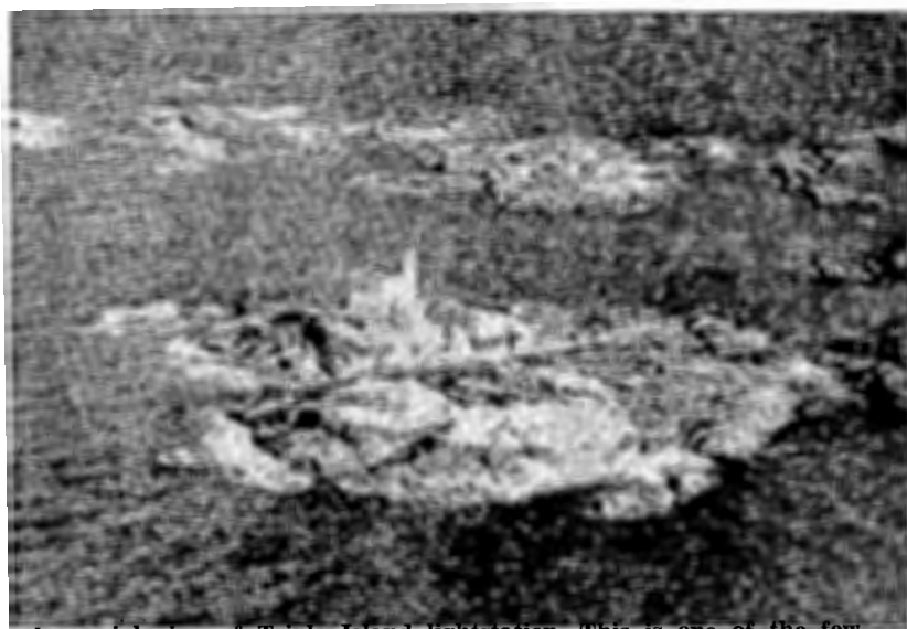
An aerial view of Triple Island lightstation. This is one of the few calm days.