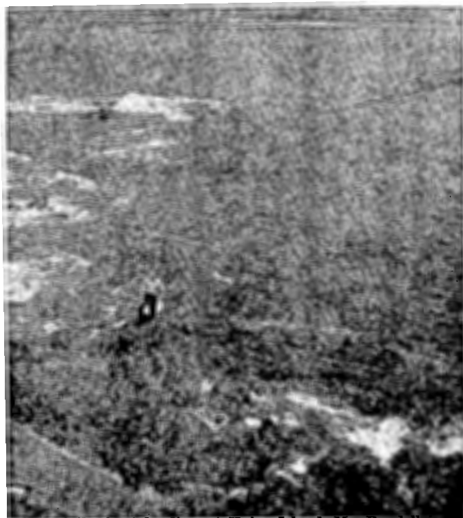
A view of the boat landing at Kains Island. Mr. Rendell is about to take the daily water sample.