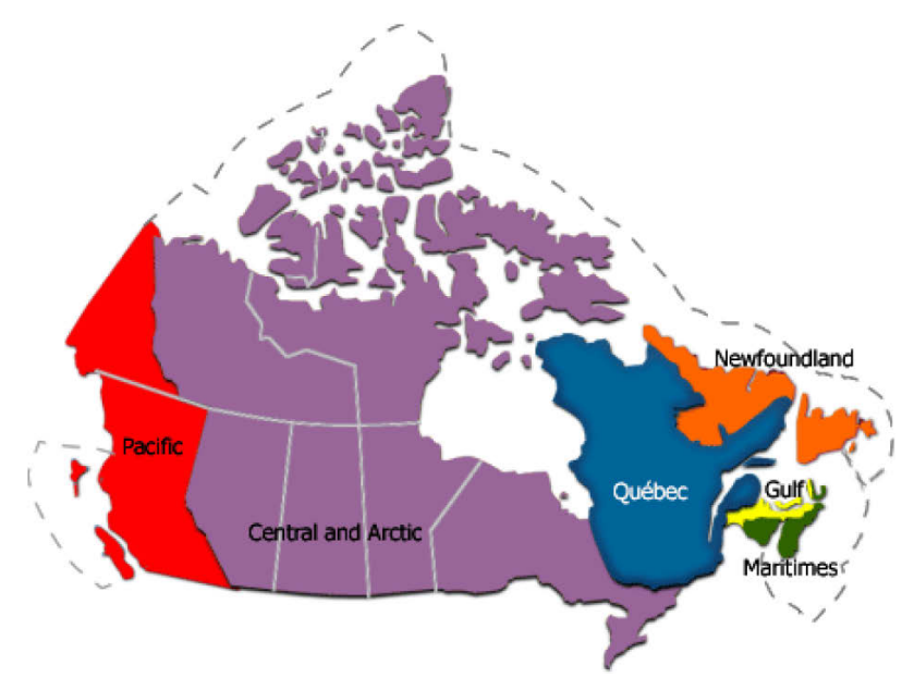
Figure 1: Map of the six administrative Regions of Fisheries and Oceans Canada (DFO).