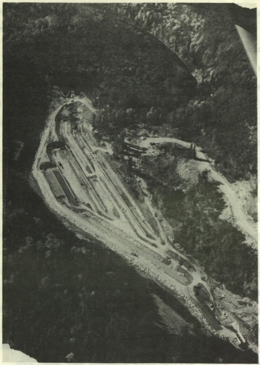
Aerial view of Fulton River Spawning Channel under construction, August, 1965. Fish entrance at lower right, water intake at upper left.

problems caused by severe climatic conditions; to measure the efficiency of the channel in terms of egg-to-fry survival; and to facilitate tests of gear and techniques which will be