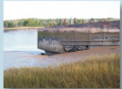
3 Old vessels on mudflats