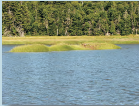
2 Grassy shoal in water way (hidden at high tide)