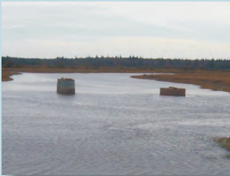
1 Old bridge posts in water way