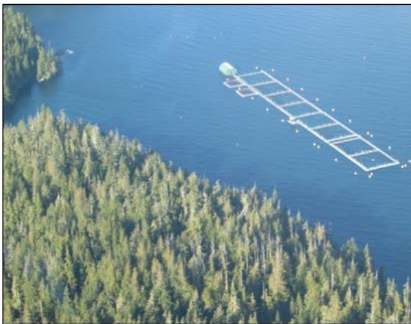
Net-pen along the coast of British Columbia.