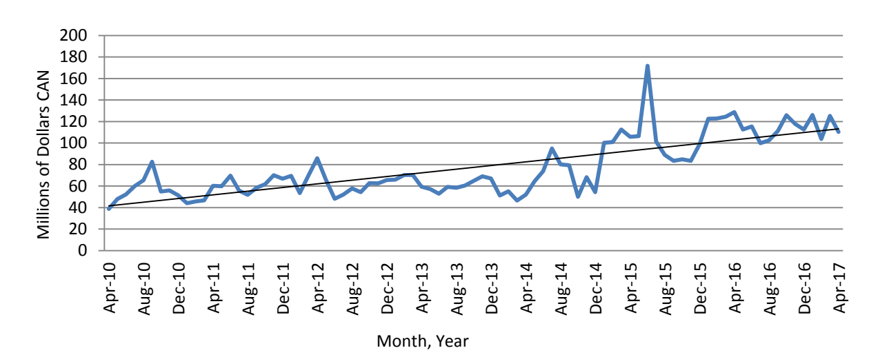
Graph 1: Canadian Net Balance of Payments for Fish, Shellfish and other Fishery Products<sup>14</sup>

The TIMAD group continued to work towards greater access to international markets for Canadian fish and seafood products. Graph 1 shows that exports minus imports have continued to increase year over year. The group also contributed to reversing the European Union's invasive species ban on live lobster imports in 2016, saving $75 million in exports.