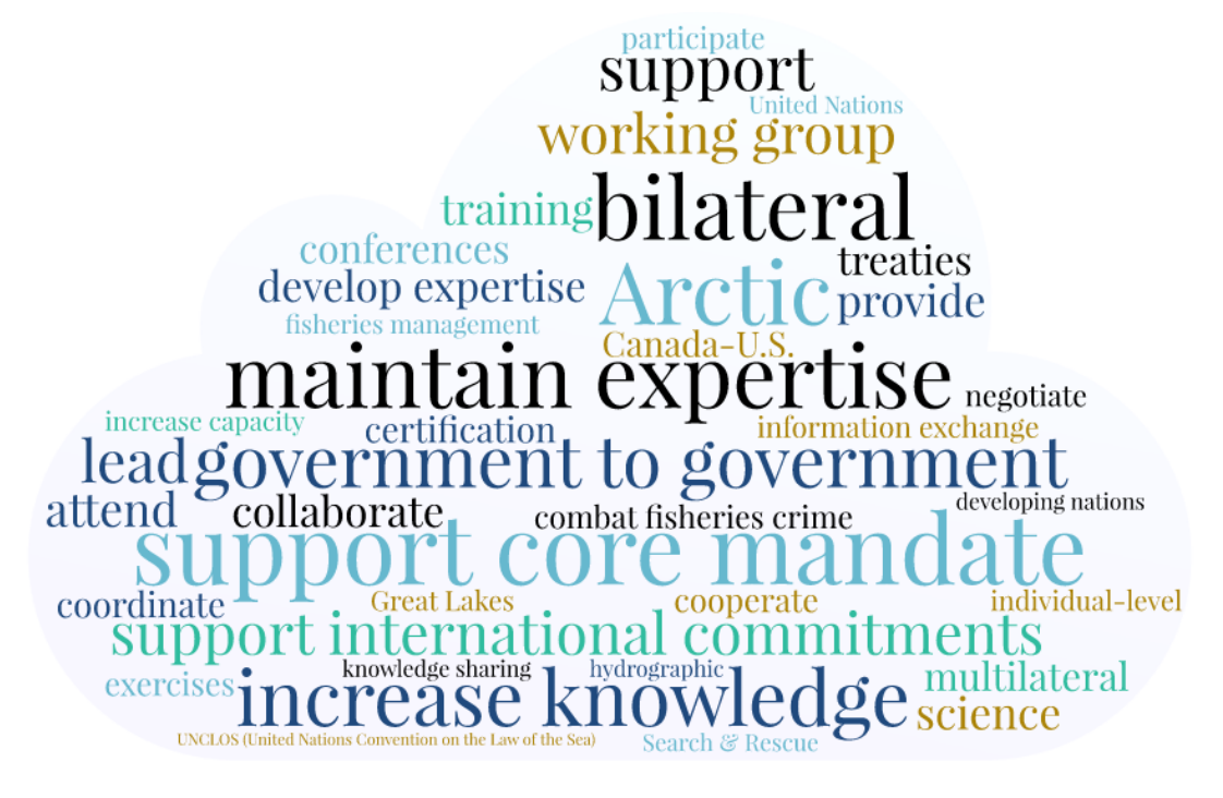
Figure 1: Word Cloud Survey of International Activities undertaken across DFO and CCG, 2016–2017

A thematic department-wide approach to reporting on international work would be particularly useful to highlight the work of DFO's science sector (EOS), which provides research advice and support to many other programs within the Department, and whose advice cannot always be directly ascribed to the programs that use it. For example, the evaluation learned that EOS has provided science advice to the IE Program that was not funded by IGS (and thus, not reported on through the IE Program): domestic science information in support of TIMAD and direct support from science representatives during international meetings, neither of which is funded by IGS. If