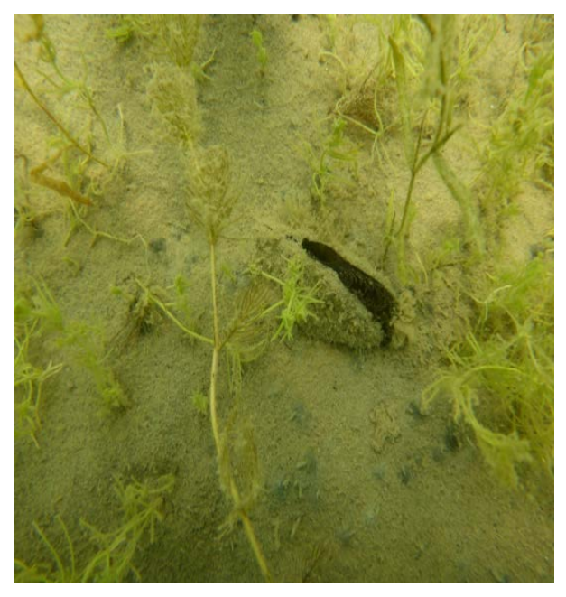
G. angulata in lacustrine habitat with a substrate mixture of sand, silt, and mud.