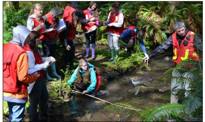
Students from Timberline Secondary conduct juvenile salmonid sampling and test stream water quality.

The first Stewards of the Future conference was held in June 2015 with 100 high-school students attending and presenting their projects. Her Honour was pleased to see the level of inquiry, analysis, and hands-on engagement displayed across so many subjects and regions. Conference themes included energy, invasive species, grasslands and ranching, parks and water. The students in the water group had the privilege to be led through their theme by Brian Riddel, CEO of the Pacific Salmon Foundation and internationally recognized fisheries