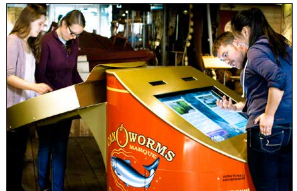
Delving into the Can of Worms.

Two school programs deliver similar messaging. Fishy Business (for grades 2-3) highlights the technological changes that have taken place over the past century and uses hands-on activities to teach the students how current fishing practices have shifted in response to declining fish populations and the sustainability of their habitats. Seafood for Thought (for grades 6-8) addresses the question, "What is ocean friendly seafood?" through the exploration of fishing methods, changes