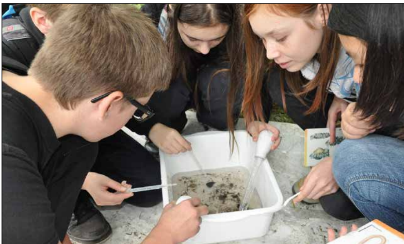
Wet, dirty, fascinating!