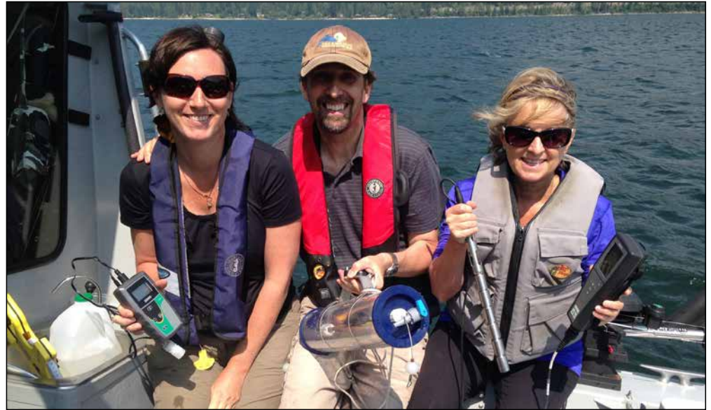
Some of our volunteer citizen-scientists brandishing a pH meter, dissolved oxygen and temperature meter, and a Van Dorn water sampler used to collect water from a discrete portion of the water column.

The Kootenay Lake Partnership (KLP) and the Friends of Kootenay Lake are two groups that are working together to protect kokanee habitat. Using the Foreshore Inventory and Mapping protocol devised by Fisheries and Oceans Canada, the KLP – which includes the regulatory agencies and First Nations – is creating an integrated approach to permitting and shoreline protection. The KLP soon will be releasing a shoreline guidance document for Kootenay Lake that brings together known ecological and First Nations cultural values. This work should help direct development in a sustainable way that protects sensitive kokanee habitat, respects Aboriginal values, and recognizes the importance of healthy fish and fish habitat to the local economy.