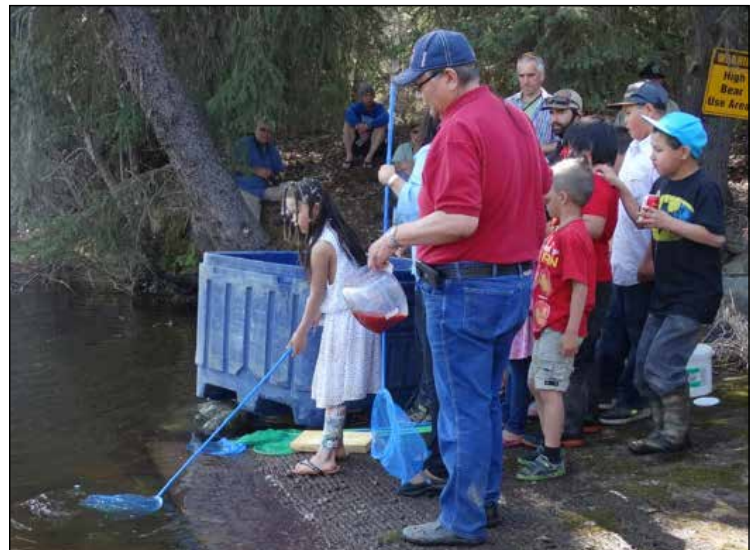
Fort Babine students release sockeye smolts.

LBN members and biologists from the SFC estimated that the total sockeye smolt population from Babine Lake was approximately 24,000,000. The estimate was lower than expected based on adult returns in 2013.