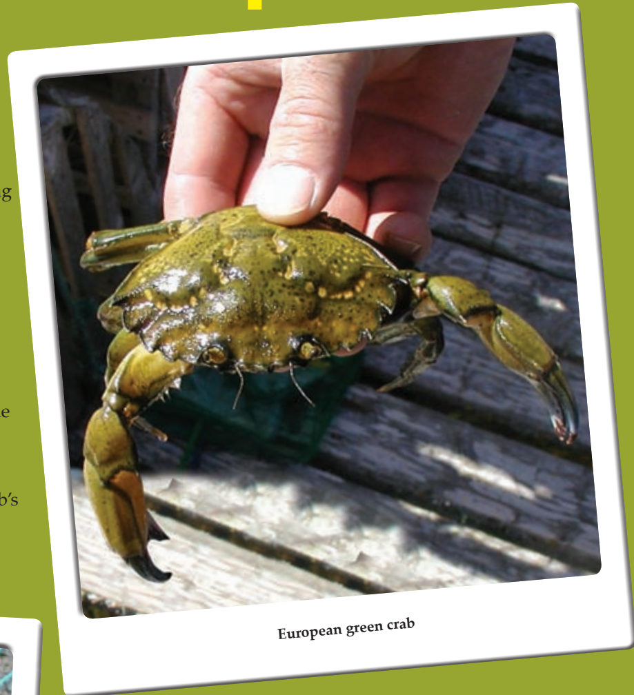
European green crab

One species often confused with the green crab is the rock crab ( Cancer irroratus ), due to the rock crab's size and shape. A rock crab can be distinguished by its scallop-shaped carapace consisting of nine rounded teeth on either side of the eyes.